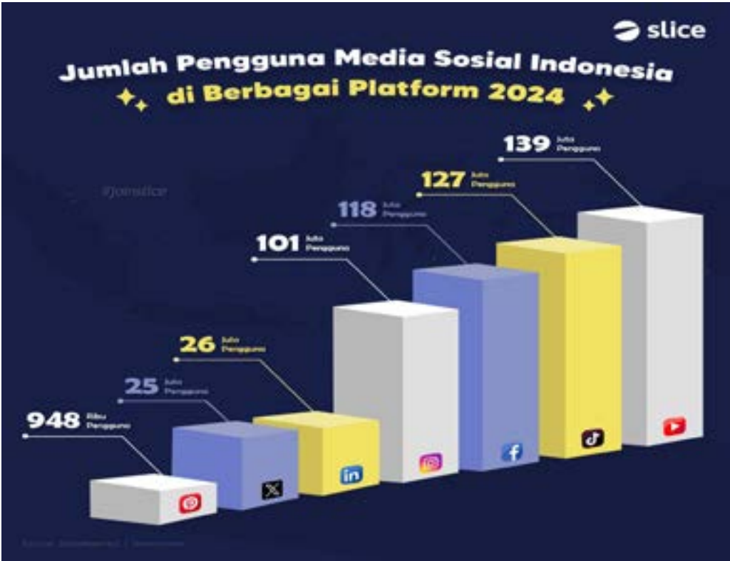
Figure. 1 Percentage of the number of social media users in Indonesia

Based on information from Datareportal.com (DataReportal.com, nd) The number of social media users in Indonesia continues to show a significant increase from year to year. These two sources reveal that this growth not only includes an increase in the number of users but also in the frequency and intensity of social media use among Indonesian society. The following is a figure 1 showing the percentage increase in social media users in Indonesia based on available data: